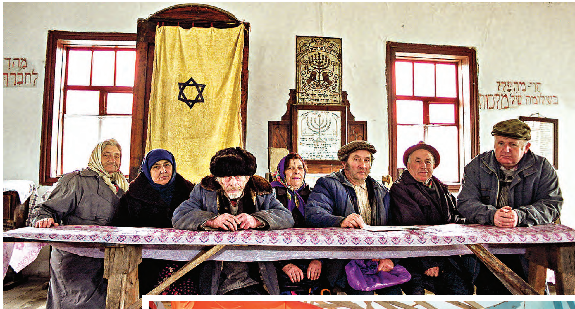
Above: Inside the 200 year-old synagogue, in Bershad, Vinnytsia, Ukraine, the community still gathers, having survived the Cossacks, the Nazis, and the Communists

Djerba at Hebrew school and also how many other such places there must be.