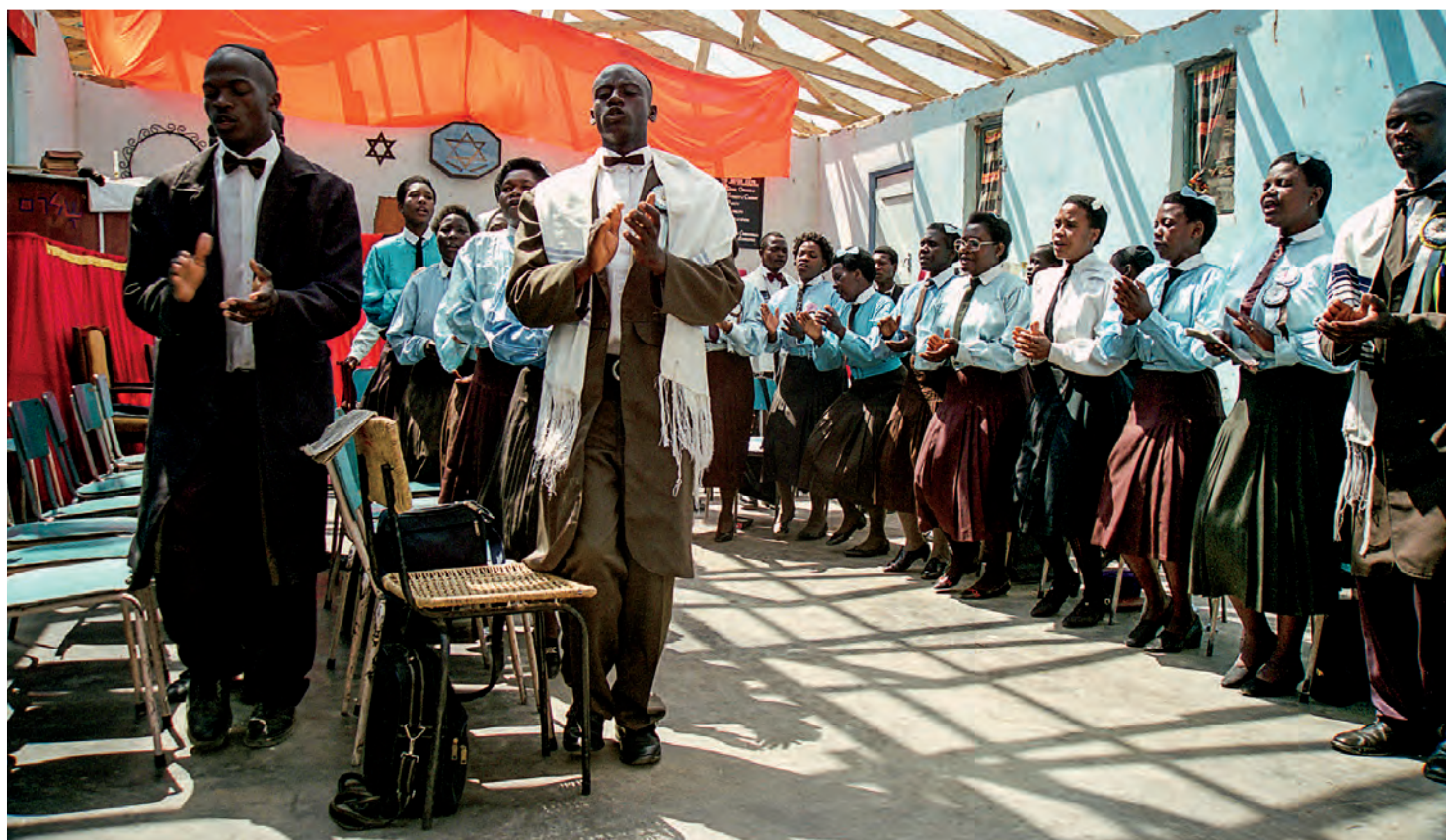
Every Shabbat morning, more than 100 members of the Shona Jewish community outside Rusape, Zimbabwe, gather at their tabernacle for services, wearing their best clothes, and sing original African-Jewish melodies in Hebrew, Shona, and English, resembling American gospel music

"I was amazed by the Marrano traditions of the Belmonte, Portugal Jews – including some of the masked Jewish holidays these celebrated for